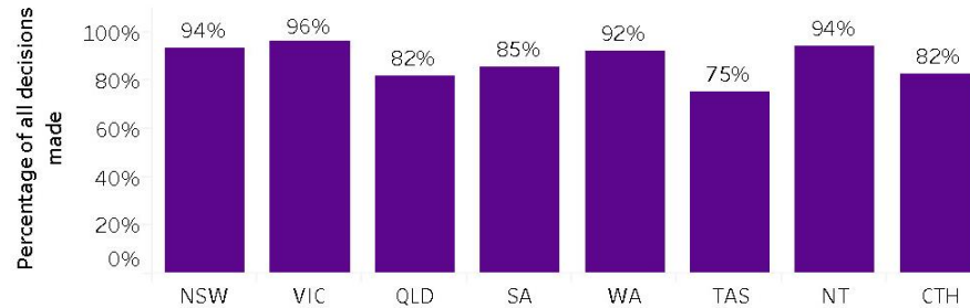
Metric 3: Percentage of all decisions made on formal applications/pages where access was granted in full or in part