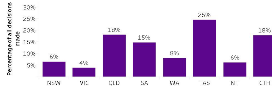
Metric 4: Percentage of all decisions made on formal applications/pages where access was refused in full