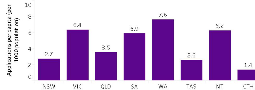
Metric 2: Formal applications received per capita