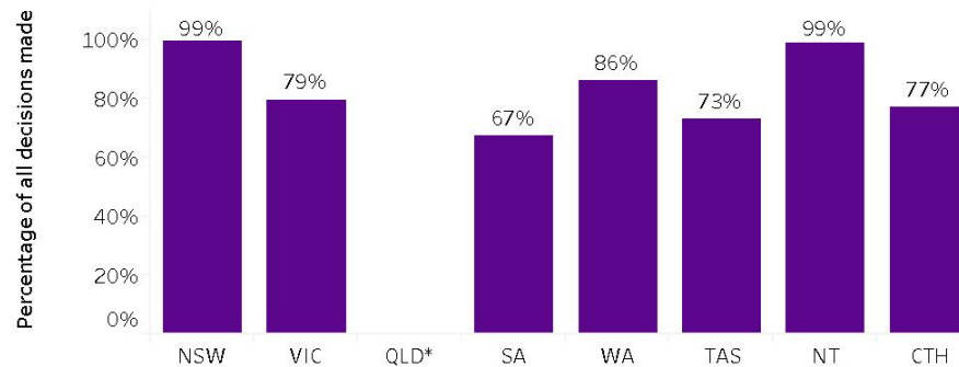
Metric 5: Percentage of all decisions made within the statutory time frame