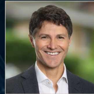
Minister for Digital, Minister for Customer Service, Victor Dominello MP